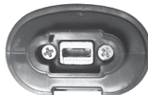
Bottom view: micro USB connector with rubber cap open.

Plug the USB cable into the AC power adapter, computer USB connector or external USB battery pack, and then plug the micro USB connector into the EXO GO to charge the battery.