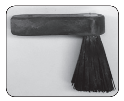
Level 3- Excessive splay, replace to prevent stalling of wiper

NOTE: It is not recommended using wiped C/T in conjuction with EXO Ammonium, Nitrate, or Chloride electrodes as they are protected with a guard which accelerates the brush splay.