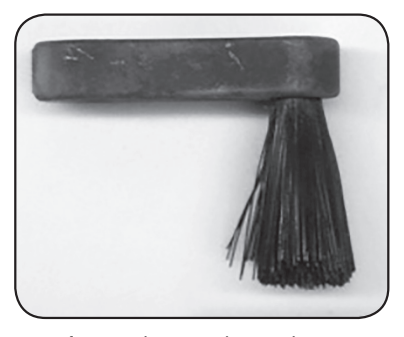
Level 2- Moderate splaying, have spare ready