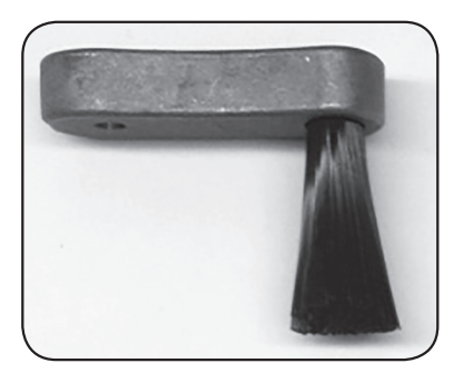
Level 1- New brush, minimal "splay"

Your new sensor includes a new wiper central wiper brush (599673). A brush's wear and replacement intervals vary greatly based on specific application challenges, but 2-12 months use has been observed. Below are three examples of brush wear that will occur naturally over use. It is recommended the wiper brush be replaced before it reaches level 3 for optimal cleaning. We recommend using a new wiper brush with the initial deployment.