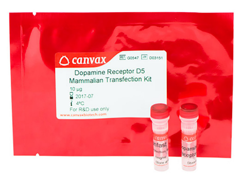
(15 \mu g = 15 \text{ assays})

For highest levels of GPCR expression, wide spectrum and complete Expression Ready GPCR ORF Clones