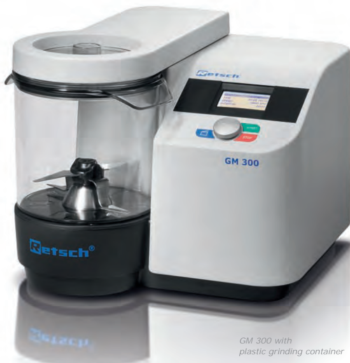
GM 300 with plastic grinding container