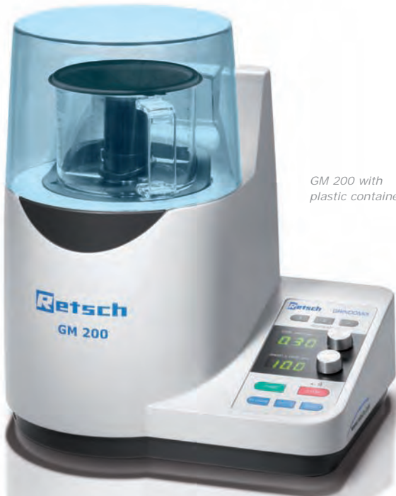
GM 200 with plastic container