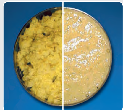
The picture shows a comparison between the degree of size reduction of raw potatoes homogenized with a household mixer (left) and the GRINDOMIX GM 200 (right)